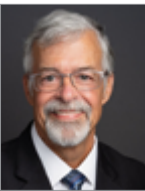
By: Brian Beaulieu CEO of ITR Economics

The shape of the recovery in your business is first and foremost a function of the decisions that you make. Ultimately, it is not up to the federal government, state/municipal governments, or COVID-19. However, these three influences must be considered to varying degrees based on the nature of your business.